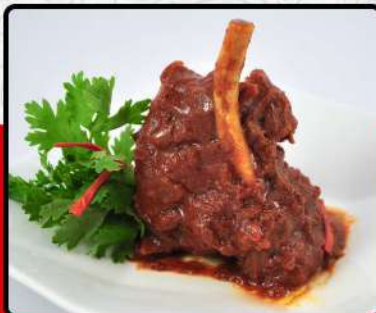
LAMB CHOP METHI KEBAB (羊排)