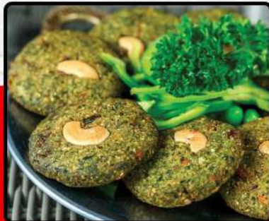
HARA BHARA KEBAB (哈拉巴拉烤肉串)