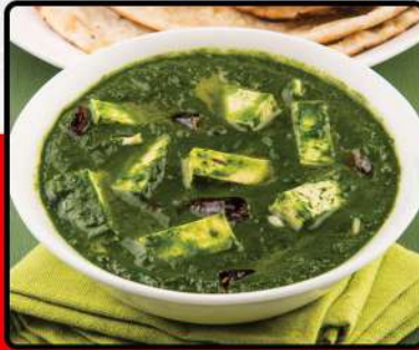
PALAK PANEER (菠菜芝士)