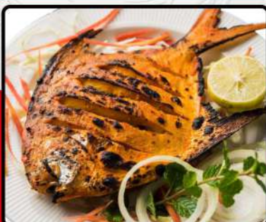
TANDOORI POMFRET (唐杜里鱼)