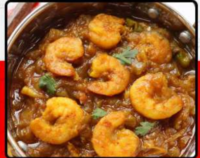
PRAWN MASALA (对虾)