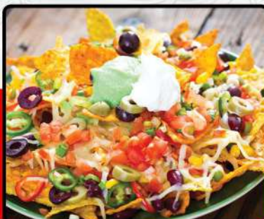
MACHO NACHO (玉米片加奶酪)