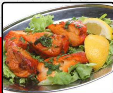
CHICKEN TIKKA SALAD (鸡肉沙拉)