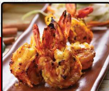
TANDOORI PRAWN (坦杜里虾)