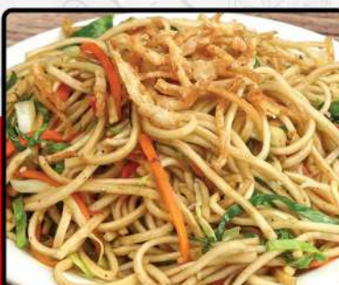
HAKKA NOODLES (客家面)