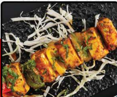
PANEER TIKKA (芝士蒂卡)