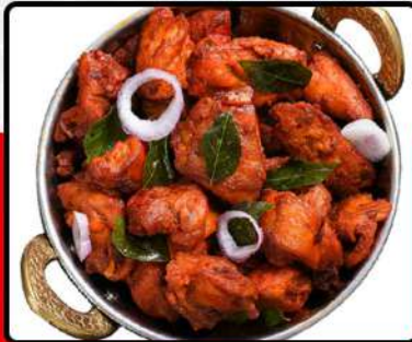
CHICKEN 65 (鸡65)