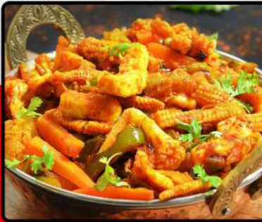
VEGETABLE JALFREZI (蔬菜沙拉)