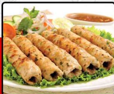
SEEKH KEBAB (烤肉串)