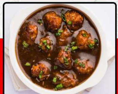
VEG MANCHURIAN (素满洲里)