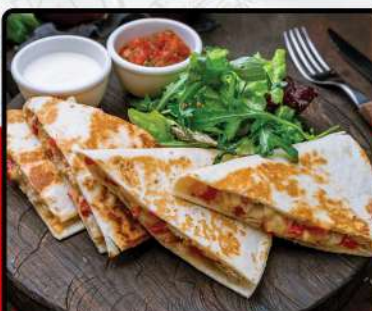
VEG/NON VEG QUESADILLA (墨西哥馅饼)