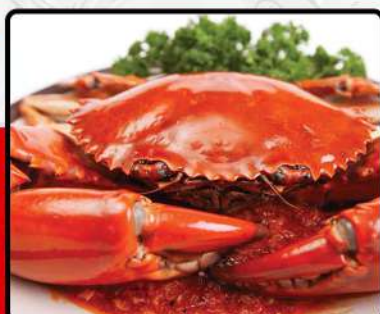
SINGAPORE SIGNATURE CRAB (辣椒蟹)