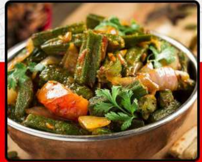
BHINDI MASALA (秋葵)