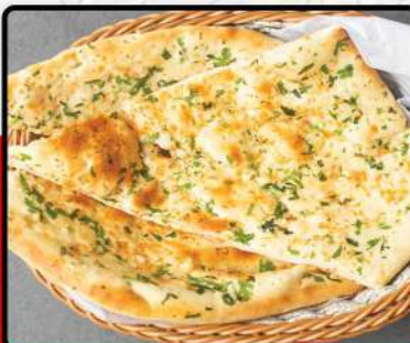
GARLIC NAAN (大蒜烤饼)