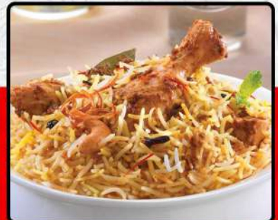
CHICKEN BIRYANI (鸡肉印度饭)