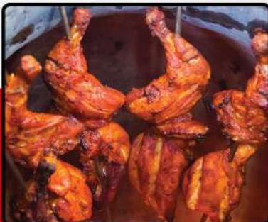
TANDOORI CHICKEN (唐杜里鸡)