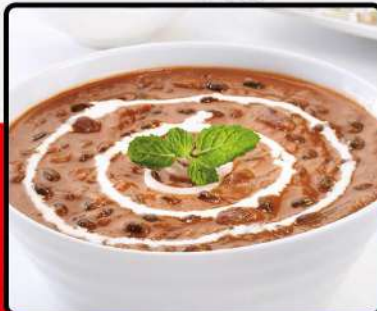
DAL MAKHANI (达尔马哈尼)