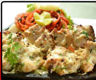
CHICKEN MALAI TIKKA (马来烤鸡)