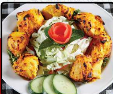
FISH TIKKA (鱼蒂卡)