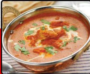
BUTTER CHICKEN (黄油鸡)