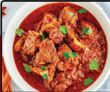
MUTTON ROGANJOSH (羊肉罗根)